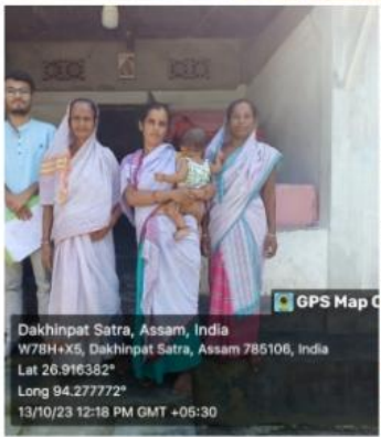
Dakhinpat Satra, Assam, India W78H+X5, Dakshinpat Satra, Assam 785106, India Lat 26.916382° Long 94.277772° 13/10/23 12:18 PM GMT +05:30