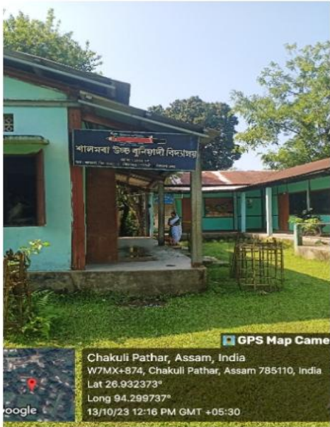
Chakuli Pathar, Assam, India W7MX+874, Chakuli Pathar, Assam 785110, India Lat 26.932373° Long 94.299737° 13/10/23 12:16 PM GMT +05:30