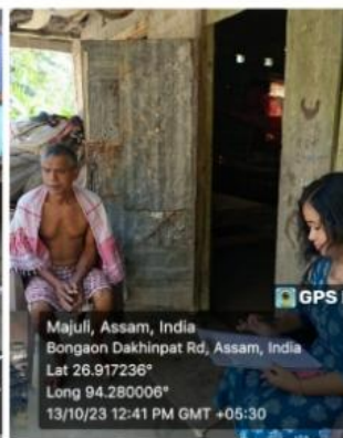
Majuli, Assam, India Bongaon Dakshinpat Rd, Assam, India Lat 26.917236° Long 94.280006° 13/10/23 12:41 PM GMT +05:30