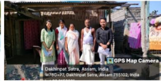
Dakhinpat Satra, Assam, India W78G+P7, Dakshinpat Satra, Assam 785102, India