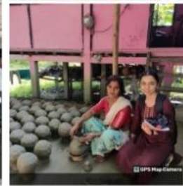
Majuli, Assam, India Bongaon Dakshinpat Rd, Assam