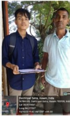
Dakhinpat Satra, Assam, India W78G+K5, Dakshinpat Satra, Assam 785102, India Lat 26.916382° Long 94.277772° 13/10/23 11:42 AM GMT +05:30