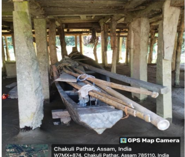
Chakuli Pathar, Assam, India W7MX+874, Chakuli Pathar, Assam 785110, India