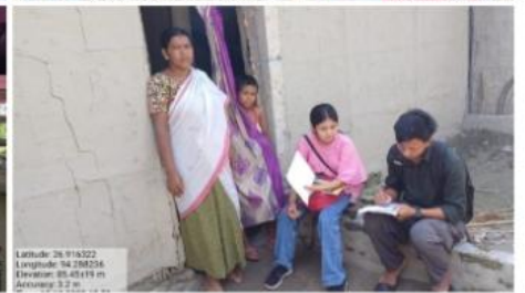
Majuli, Assam, India Bongaon Dakshinpat Rd, Assam