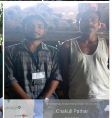
Chakuli Pathar, Assam, India Unnamed Road, Chakuli Pathar, Assam, India Lat 26.933201° Long 94.294264° 13/10/23 12:23 PM GMT +05:30