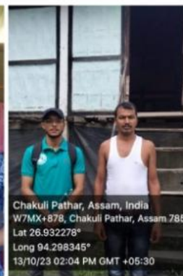
Chakuli Pathar, Assam, India W78M+82B, Chakuli Pathar, Assam 785102, India Lat 26.932278° Long 94.298345° 13/10/23 02:04 PM GMT +05:30