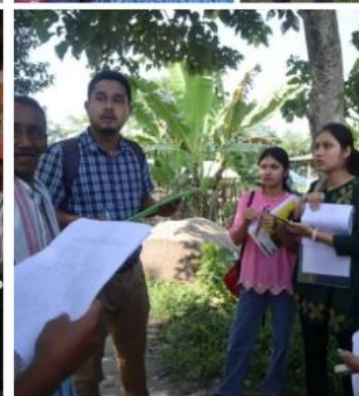
Chakuli Pathar, Assam, India Unnamed Road, Chakuli Pathar, Assam, India Lat 26.933201° Long 94.294264° 13/10/23 12:23 PM GMT +05:30