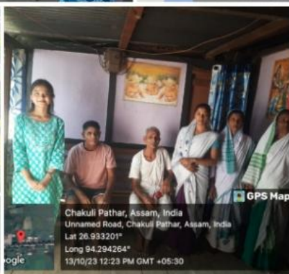
Chakuli Pathar, Assam, India Unnamed Road, Chakuli Pathar, Assam, India Lat 26.933201° Long 94.294264° 13/10/23 12:23 PM GMT +05:30