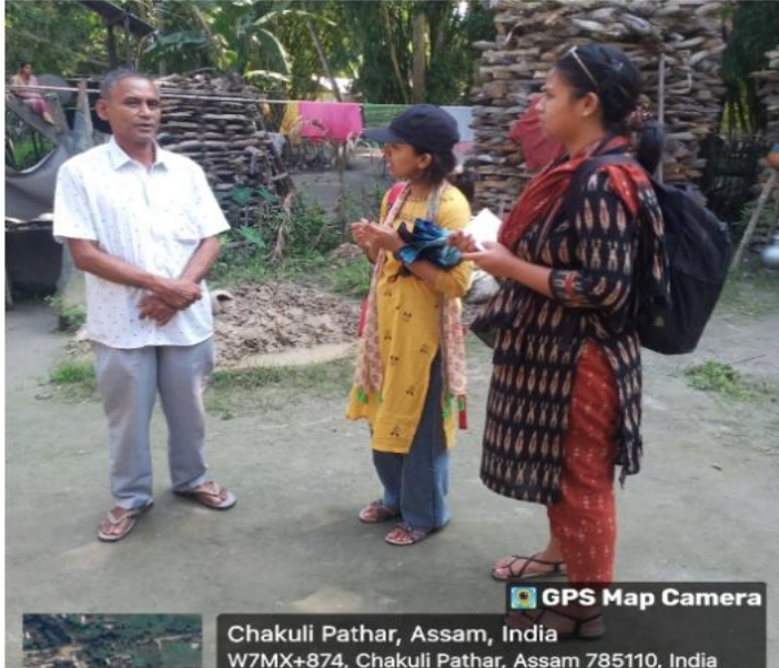
Chakuli Pathar, Assam, India W7MX+874, Chakuli Pathar, Assam 785110, India