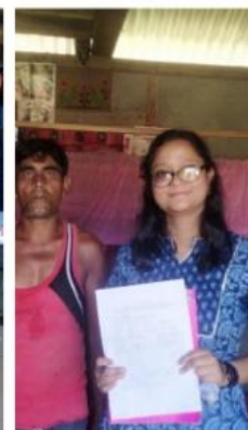
Chakuli Pathar, Assam, India W78M+82B, Chakuli Pathar, Assam 785102, India Lat 26.932278° Long 94.298345° 13/10/23 02:04 PM GMT +05:30