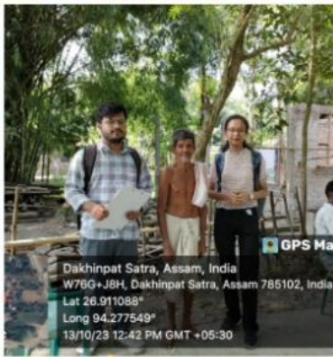
Dakhinpat Satra, Assam, India W78G+J8H, Dakshinpat Satra, Assam 785102, India Lat 26.911088° Long 94.277549° 13/10/23 12:42 PM GMT +05:30