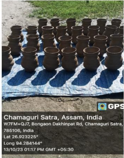
Chamaguri Satra, Assam, India W7FM+QJ7, Bongaon Dakhinpat Rd, Chamaguri Satra, 785106, India Lat 26.923225° Long 94.284144° 13/10/23 01:17 PM GMT +05:30