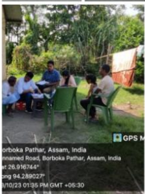
Borboka Pathar, Assam, India Unnamed Road, Borboka Pathar, Assam, India Lat 26.916744° Long 94.289027° 13/10/23 01:35 PM GMT +05:30