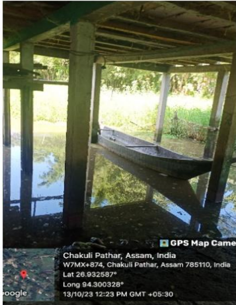
Chakuli Pathar, Assam, India W7MX+874, Chakuli Pathar, Assam 785110, India Lat 26.932587° Long 94.300328° 13/10/23 12:23 PM GMT +05:30