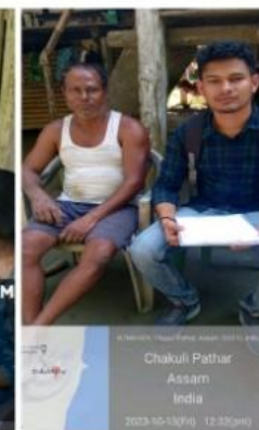
Chakuli Pathar Assam India 2023-10-13(Fri) 12:35(pm)