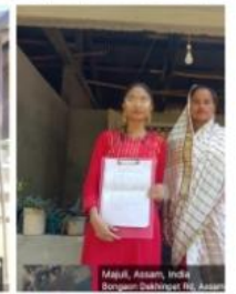
Majuli, Assam, India Bongaon Dakshinpat Rd, Assam