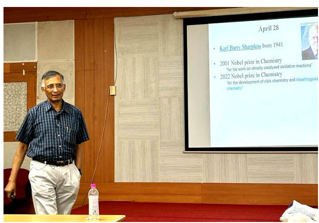
Page 6 of 12