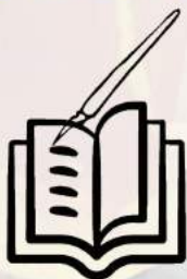
a bowl of tales